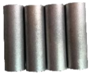
WHEEL SPACERS (X4)